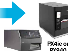
PX4ie or PX940